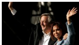
Money, Politics Stir Argentine Intrigue