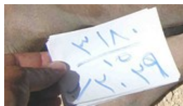
10,000 Bodies: Inside Assad's Crackdown